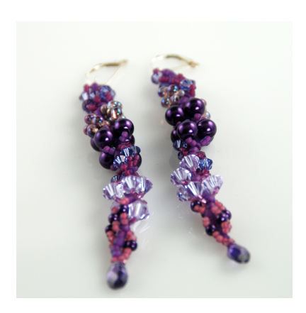
Big A$$ Purple Earrings